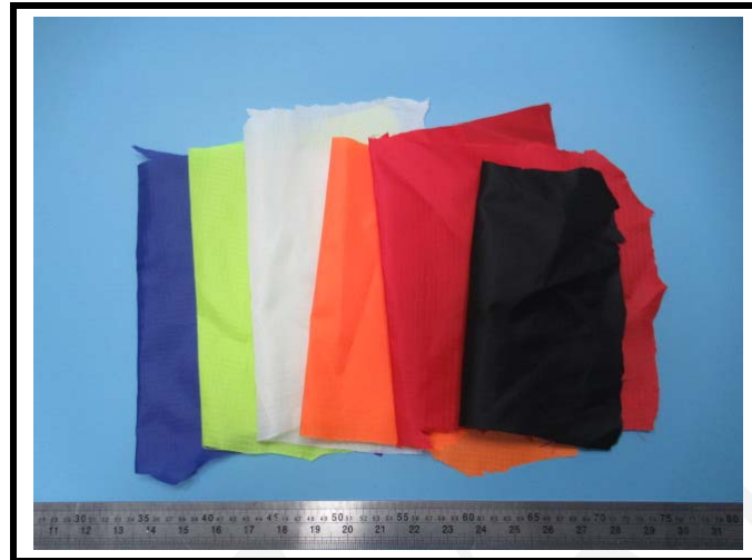
Photograph of Sample (for reference only)