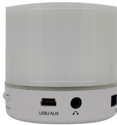
2. SIDE 2