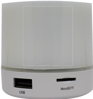
4. SIDE 4