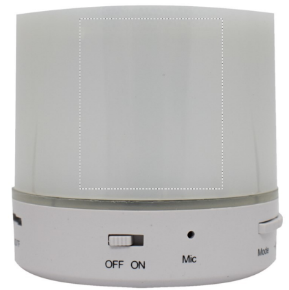
3. SIDE 3