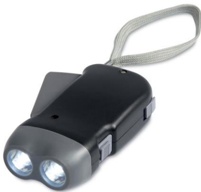
Item number MO8235

This way we offer everyone access to sustainable products at attractive prices. We want our customers to recognize our sustainable products and understand why the item is sustainable, this will then allow an educated choice when selecting a product from our collection.