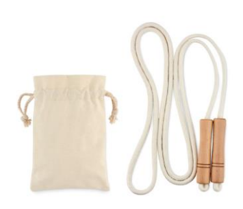
Item number MO6140

We want our customers to recognize our sustainable products and understand why the item is sustainable, this will then allow an conscious choice when selecting a product from our collection.