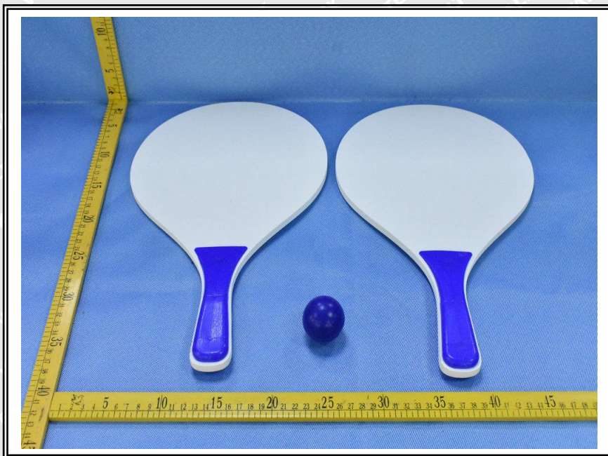
Photograph of parts tested: